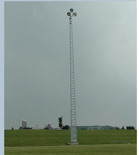
Titan tower - 80ft T400 model