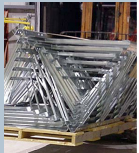
Tower ships nested to minimize freight